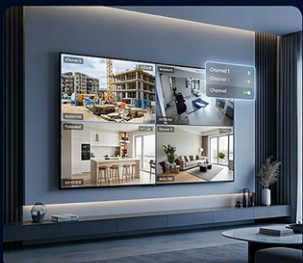
Real-Time Live View