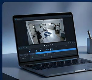
Replay Important Evidence